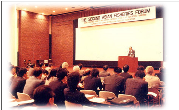
Opening Ceremony – 2AFF in Tokyo, Japan