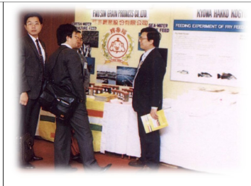
Visitors to the Trade Exhibition, 2AFF held in Tokyo.

The proceedings of the 2AFF which contain 228 full oral papers and posters covering major reviews on AP Fisheries and aquaculture, nutrition and advances in tropical fisheries research was published by the Society details of which are given below: