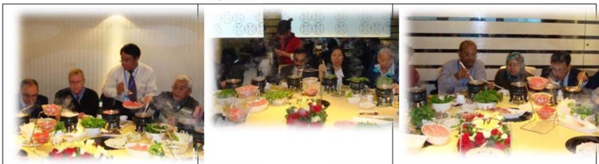
AFS joint 9 th and 10 th councillors dinner

A get to know-you joint 9 th /10 th Councilors dinner was held to celebrate the successful completion of the 9AFAF and the handover to the 10 th Council.