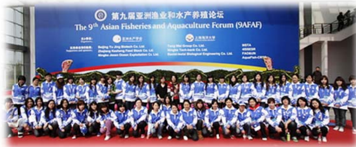
SHOU volunteers group photo

Unique to the AFS forum is the SHOU use of the university’s students to form welcome committees, work with 9AFAF registration desk and served as guides to participants during the duration of 9AFAF. The highlight of the university students’ involvement is the SHOU Music Society’s presentation of a musical cum cultural show during the forum.