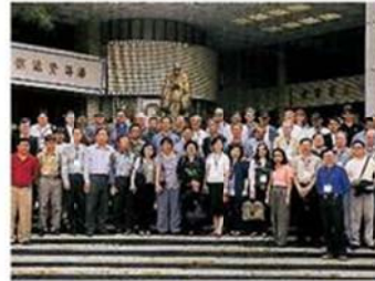
Field trip participants in front of the Penghu Marine Resources Museum