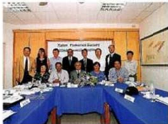
The 22 nd Council Meeting of the Asian Fisheries Society was held at the Penghu Aquarium in conjunction with the Symposium