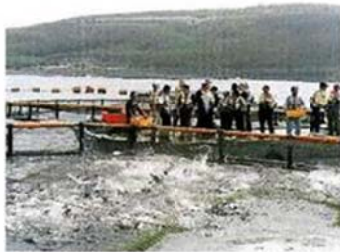
The participants visiting cobia cages in Penghu