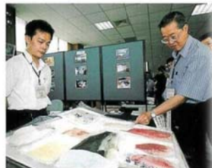
Frozen seafoods on display in one of the exhibition booths