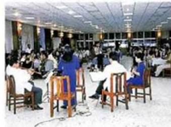
Entertainment during the Closing Ceremonies