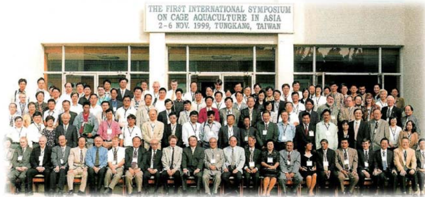
Welcome and keynote addresses during CAA1