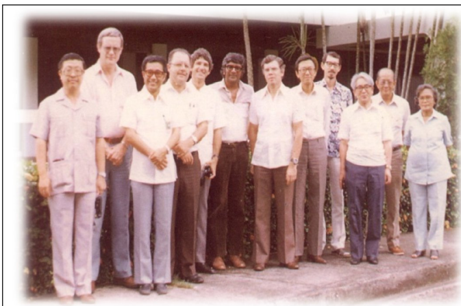
Group photograph for the May 1984 meeting at Los Baños, the Philippines that formally established the AFS.

Each triennial Forum (AFF), to be hosted and convene by a member of the Asian-Pacific (AP) countries, brings together all key aquaculture and fisheries stakeholders from the region and provides a venue to discuss regional priorities, common problems and research finding. It may also provide guidelines and direction to policymakers and planners attending the forum.